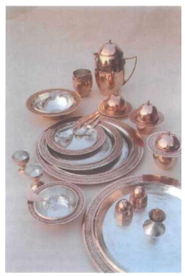
Vibhor Sogani's products—keeping the traditional idiom intact

In India, crafts are more than just a commodity. They are a reminder of a rich, colourful and aesthetic civilization. They also speak of the reach of this country in the kind of crafting traditions that spread from her shores. Crafts are significant in their 'material' contribution to this country's spirituality imbued with a pragmatic wisdom and understanding of human life, its needs and much more. They are not just a repository of the past, but also the seeds of the future. If technology is used appropriately, as and when needed without losing 'the touch' that makes us sensitive to materials, to others, ourselves and the world in general, if the more frugal, subtle, patient and quieter sensibility that frames the attitude and stance of those that prefer to work with their hands, is allowed to survive this frenzied world, however subtle, however softly they tread and speak, one can only hope that their wisdom will prevail. 🅦