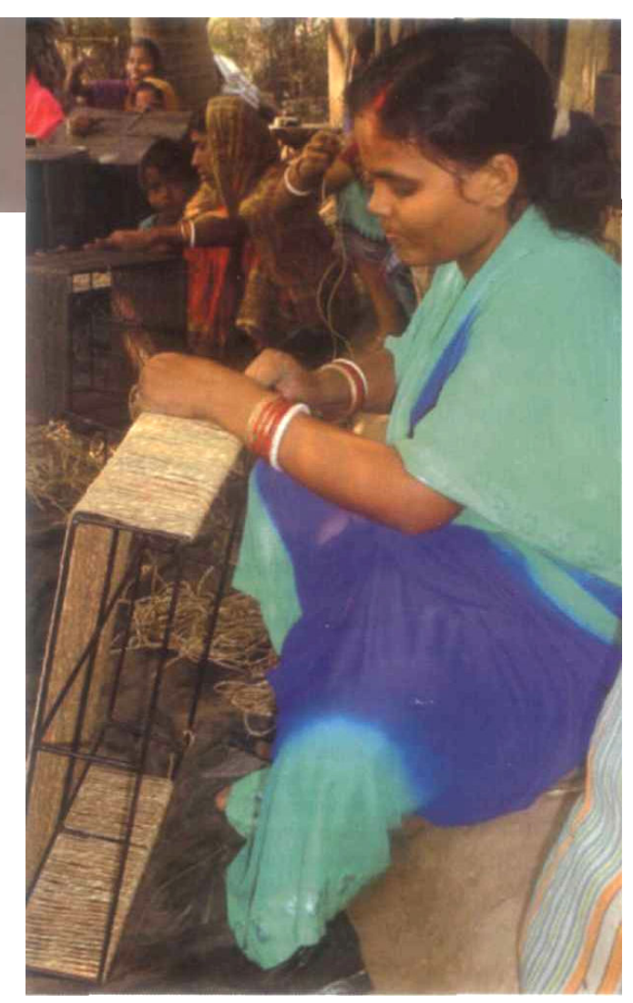
Craftswomen working with sabaii grass in Orissa

Working with our hands has far deeper significance than we can imagine. It has been said that "the culture of thinking requires a culture of hand as a subtle,